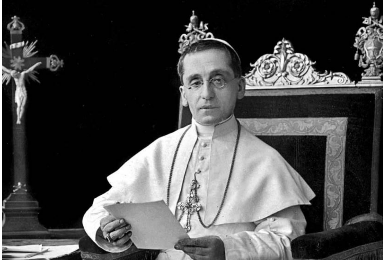
Pope Benedict XV.

The importance of All Souls Day was made clear by Pope Benedict XV (1914-22) when he granted all priests the privilege of celebrating three Masses on All Souls Day: one for the faithful departed; one for the priest's intentions; and one for the intentions of the Holy Father. On only a handful of other very important feast days are priests allowed to celebrate more than two Masses.